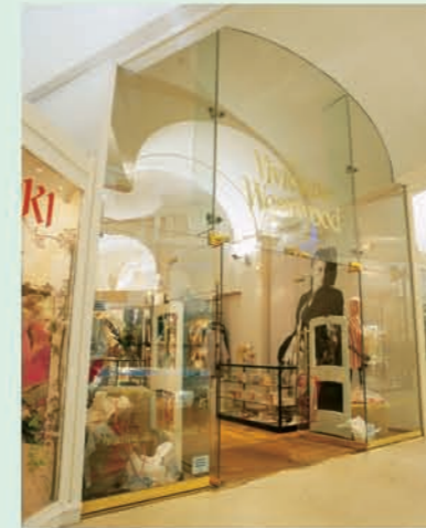
Vivviene Westwood, Liverpool