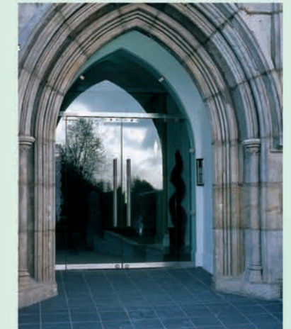
Church Apartments, Manchester