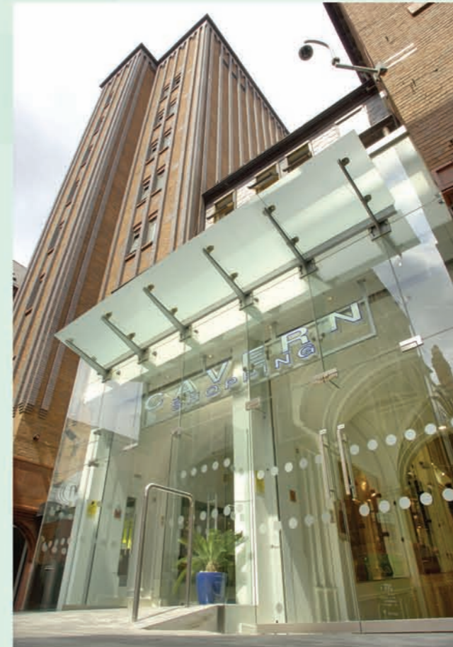
Cavern Walks, Liverpool